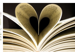
Language and Literature GPS Standards