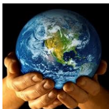
Individuals and Societies GPS Standards