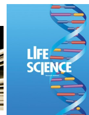
Life Science GPS Standards