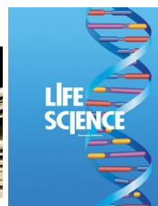
Life Science GPS Standards