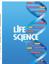
Life Science GPS Standards